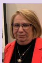
Suzanne Mills-Wasniak Homeless Shelter Food Production: Positive Implications for Clients and Volunteers